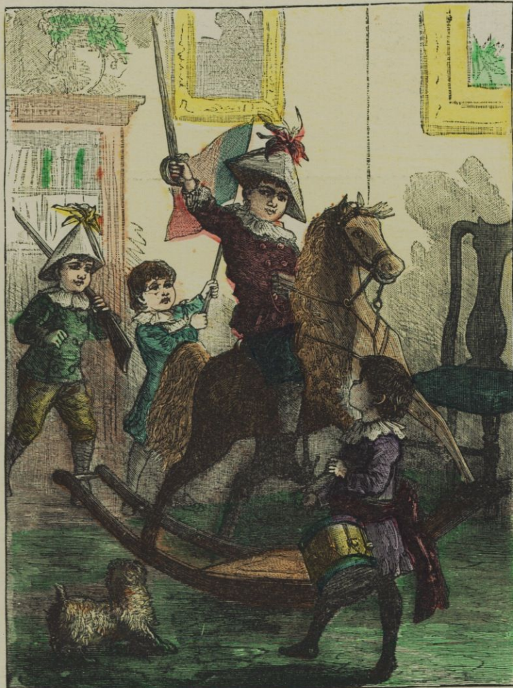
LE COMMANDANT EN CHEF.

po-li ta-re ci-re ki-lo vi-de tu-be ra-ve ri-re pa-pa ca-ge